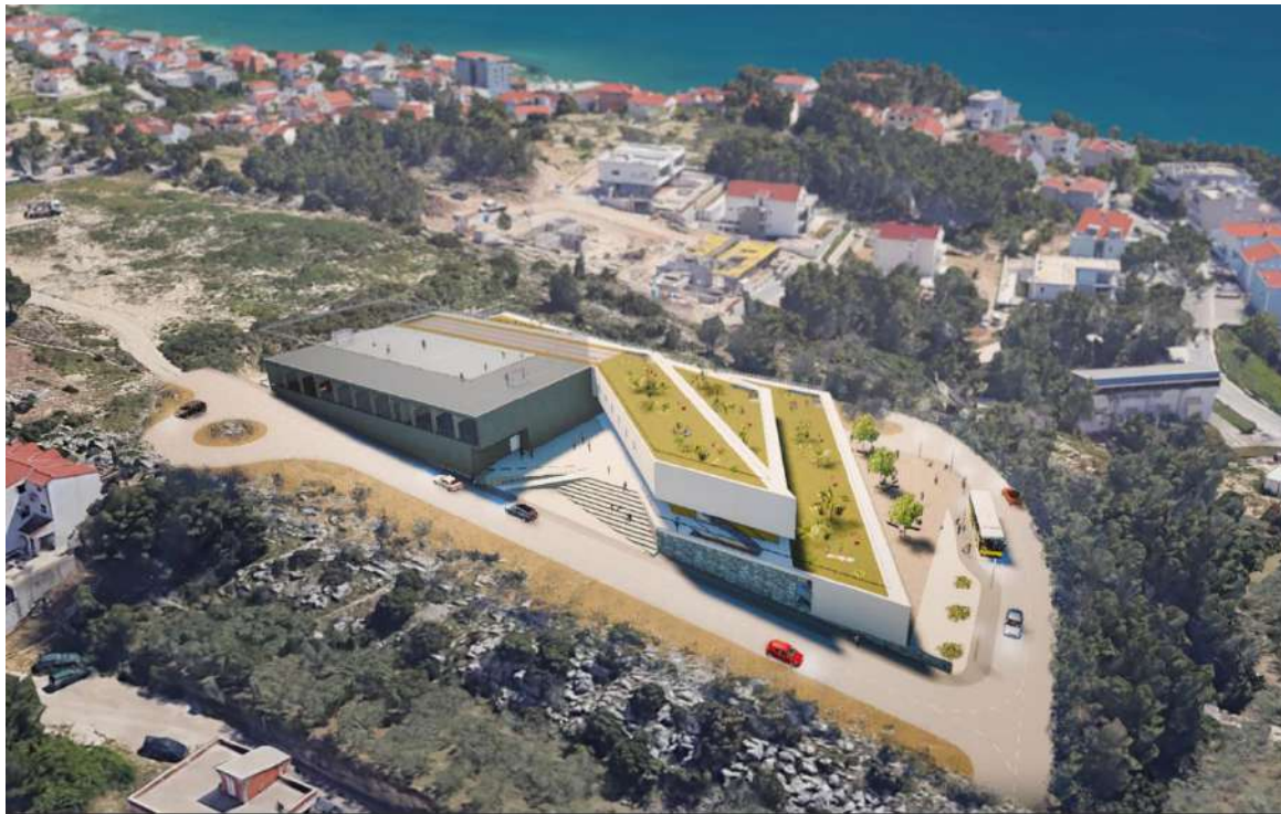
New elementary school in Podstrana