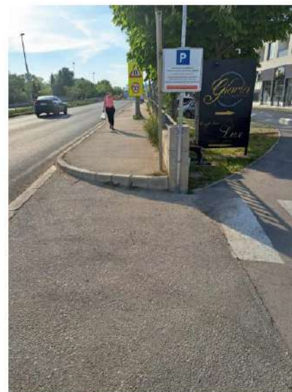
Slika 2. Ulica Strožanačka Cesta Potrebno je ugraditi jednu rampu na ulazu kod restorana Gloria