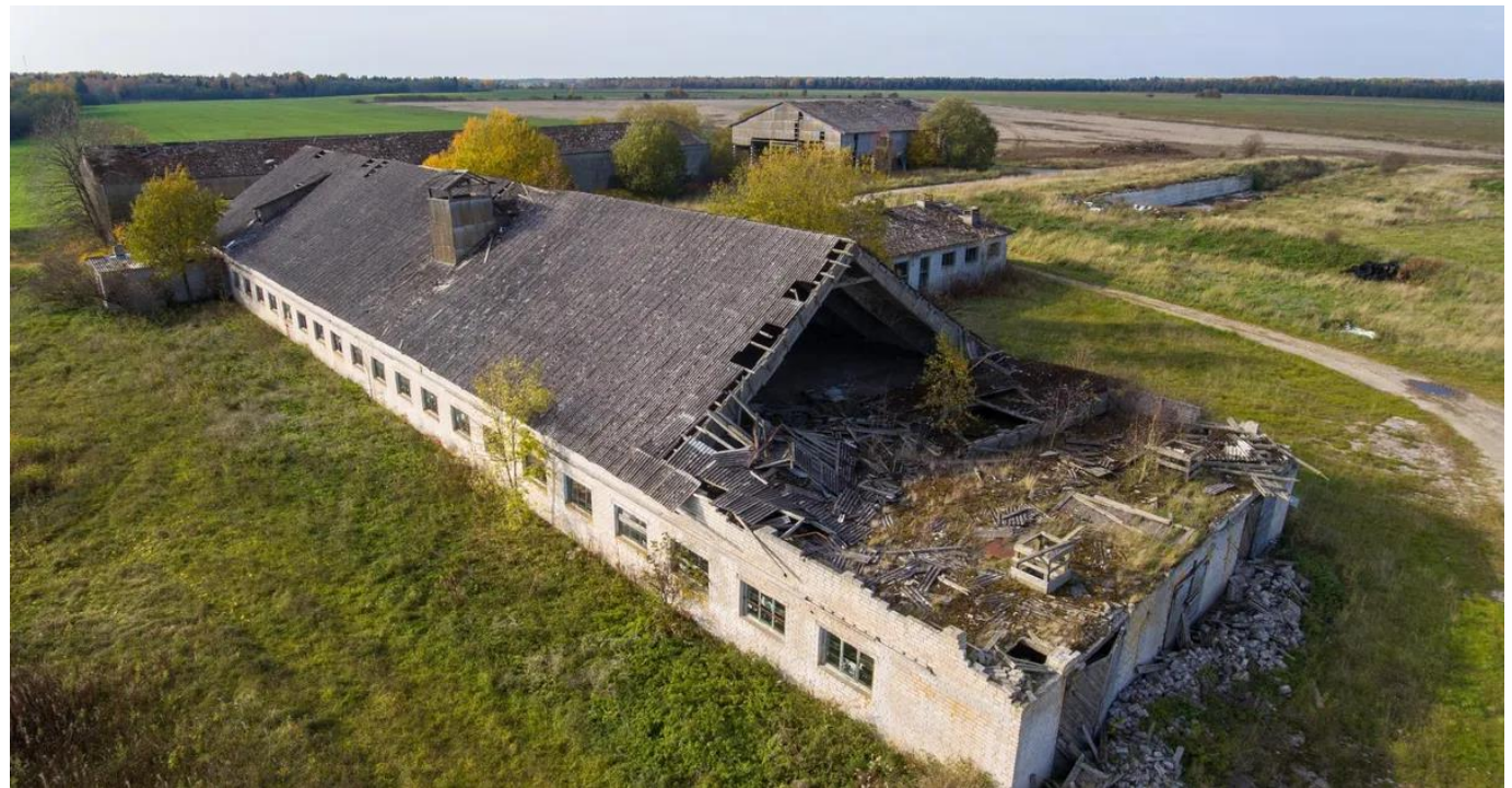
Former farm house build to factory

Roheveski is a private company established by the Estonian Small Slaughterhouses Association (EVTL), with the goal of adding value to bioresources by processing 2nd and 3rd category animal waste.